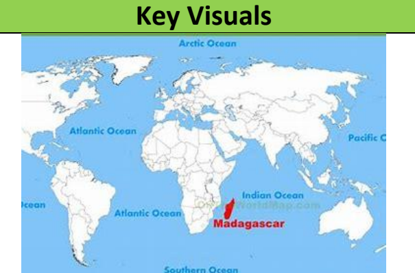
A map showing Madagascar and the surrounding continents and oceans.