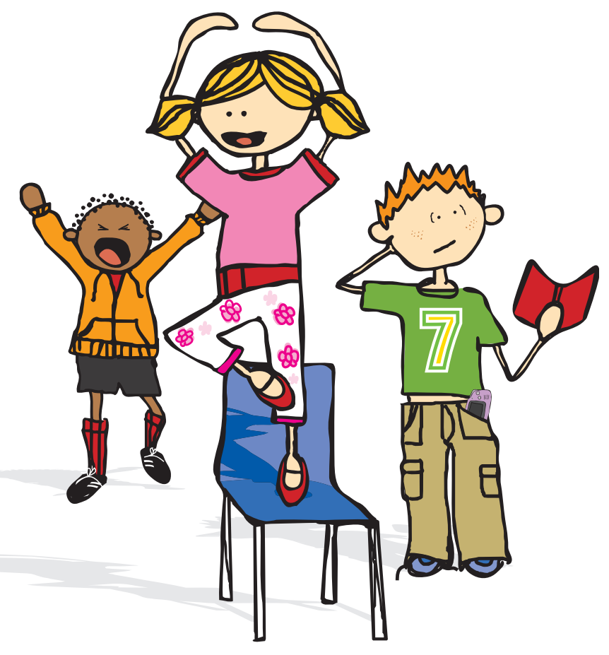
difficult to sit still